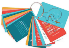
Divine Mercy Chaplet

Now available in the Adoration Chapel and in our parish library to check out!