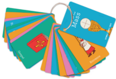
Parts of the Mass

If there are any questions, please call 316-685-5240 or email me at omfl@catholicdioceseofwichita.org .