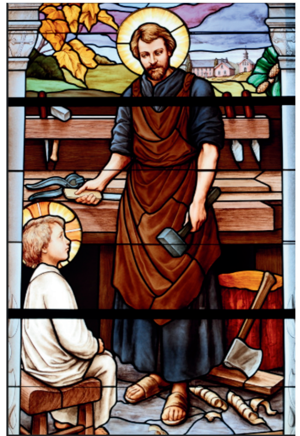
St. Joseph the Worker Feast Day May 1st